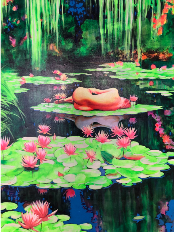
THE POND OF SERENITY

OIL AND ACRYLIC ON CANVAS 40 X 52 INCHES